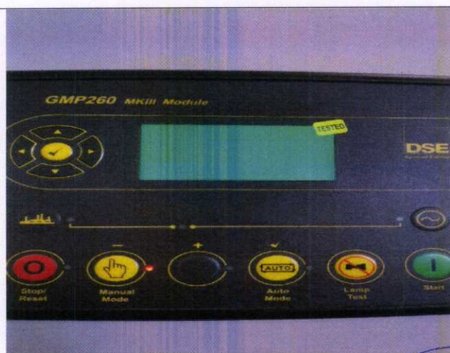
During the testing