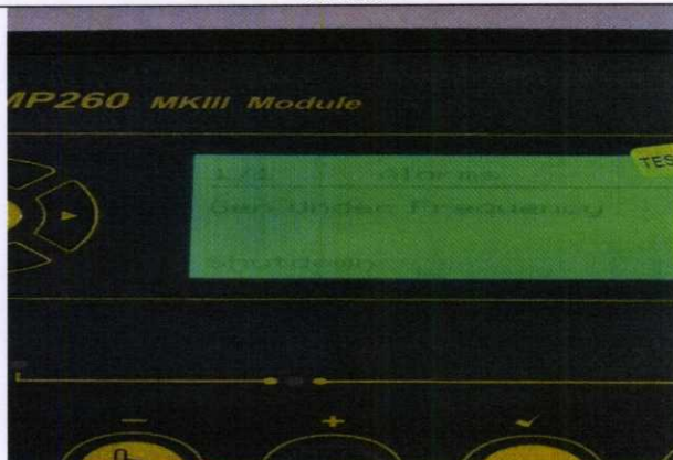
During the testing