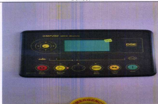
During the testing