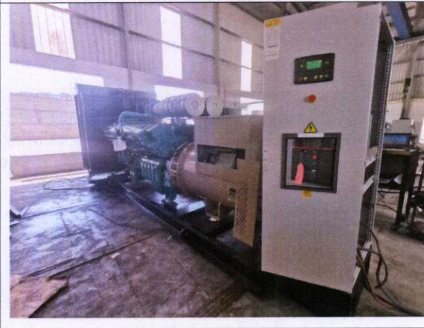
During the testing