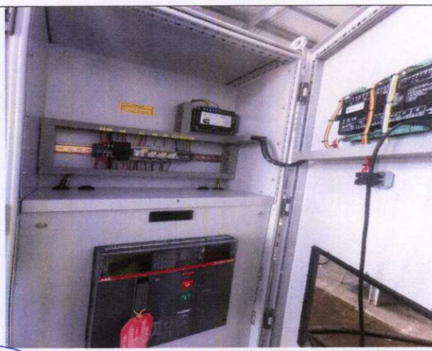
During the testing