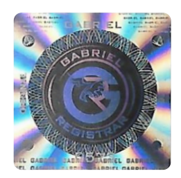
Issue No: 01